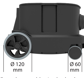
Extra large rubberized wheels and casters provide high grade agility and stability.