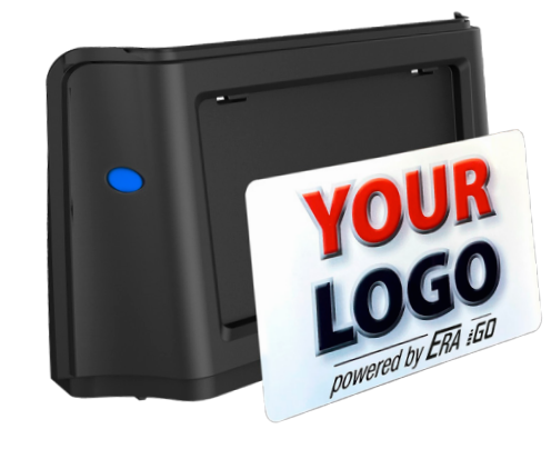
Your brand. Your corporate identity. We print your logo.

The ERA iGO also impresses with its extremely low accoustic pressure level of only 60 [dB] or 55 [dB] in ECO mode. This makes it ideally suitable for cleaning heavily frequented areas such as hotels or offices.