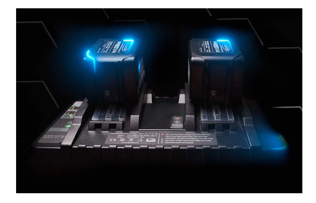
Double - fast charger Charging time 5 Ah batteries approx. 1 hour. 7.5 Ah batteries approx. 1.5 hours.

Owing to a display on the motor head the power level as well as the battery status can be constantly monitored.