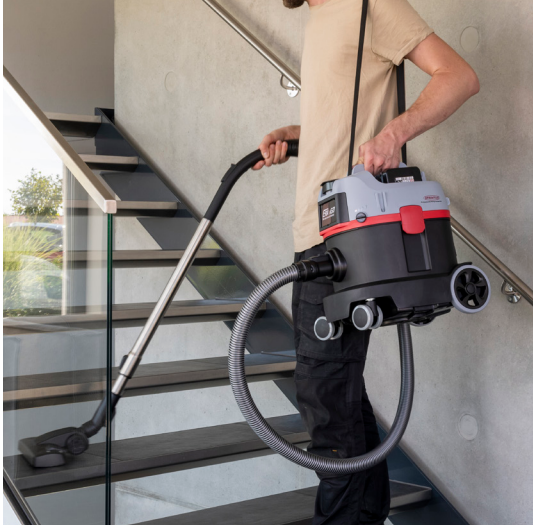
Thanks to the integrated, extendable carrying strap, you can easily carry the lightweight and compact vacuum cleaner over your shoulder especially in confined spaces and stairwells.