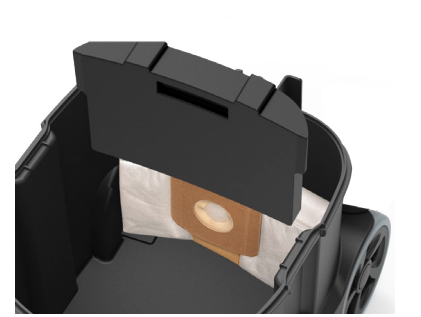
The extra storage space for filter bags saves time and enables changing the filter bag, especially when running out of stock.